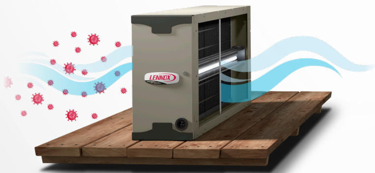
Lennox PureAir™ S